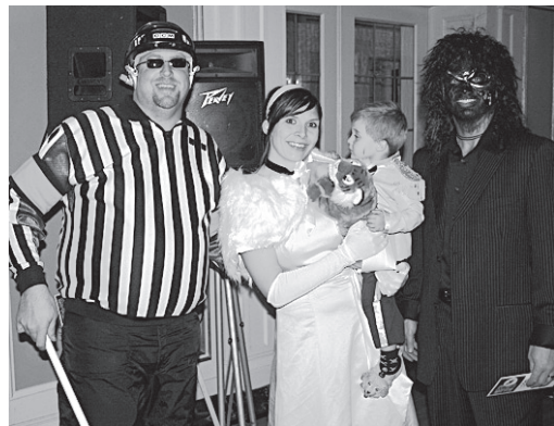
Here are our costume contest award winners! From left to right: Blind Referee, Sleeping Beauty and Peter Peter Pumpkin Eater.

A fun twist added to the event was a "costume optional" theme, which many guests took advantage of to showcase their pre-Halloween spirit. Awards were given to the best costumes.